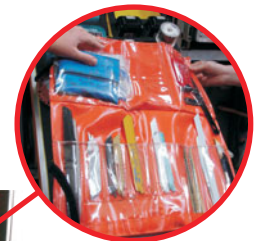
Tool wrap for blades and accessories

Vimpex are an official service and warranty repair agent for all petrol and electric Makita products.