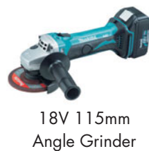
18V 115mm Angle Grinder