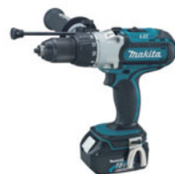
18V 3 speed Combi-Drill