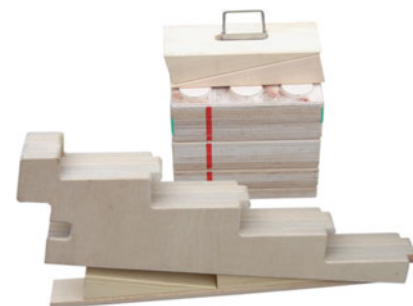
TimberJack - Laminated Stabilisation Blocks

Once used, the blocks quickly and conveniently store away on their frame and the handle flips through 90° to secure the system during transport.